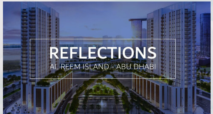
Reflection By Aldar