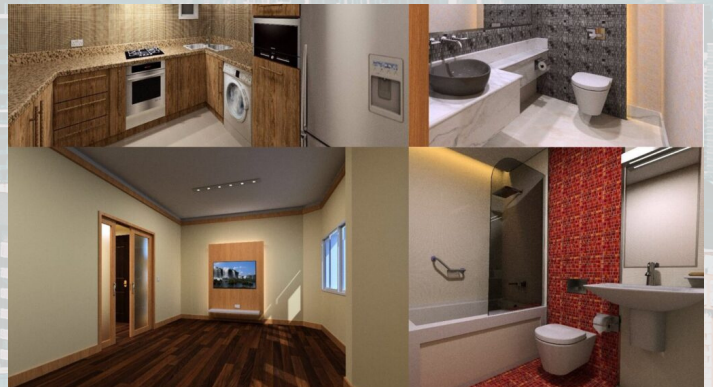
MFMB Residential Tower