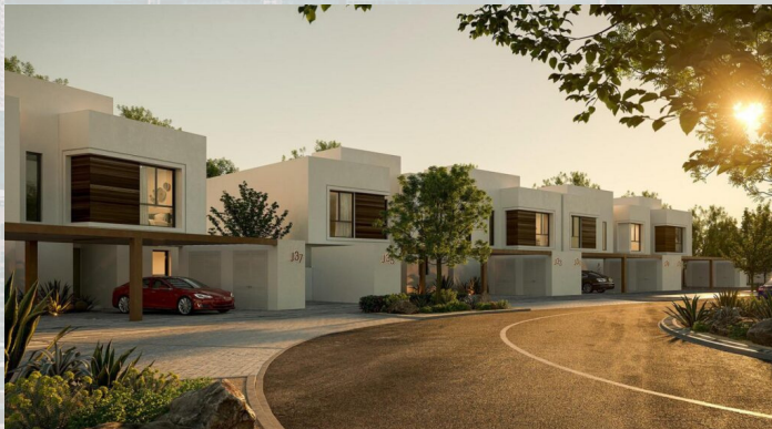
Noya by Aldar